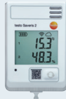
testo Saveris 2-H1