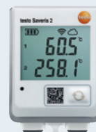
testo Saveris 2-T3