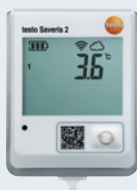
testo Saveris 2-T1