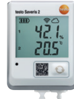
testo Saveris 2-H2