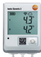
testo Saveris 2-T2